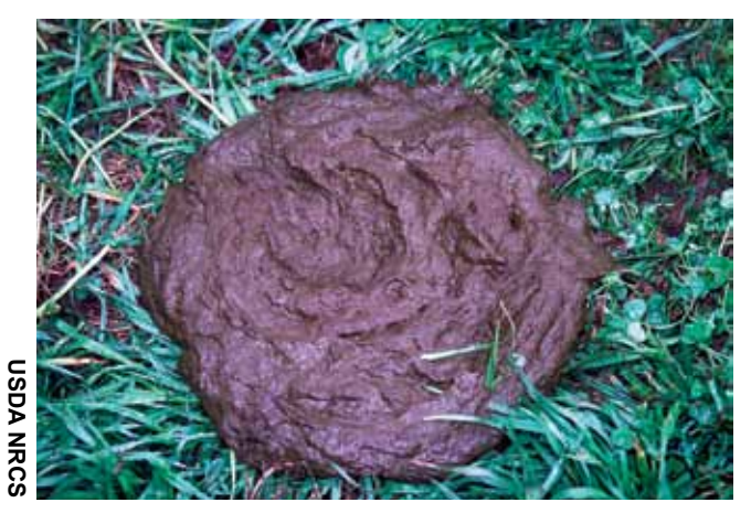
Animal feces can contain pathogens that make humans sick.

To put it bluntly, poop contains pathogens. That said, not all poop contains pathogens that make humans sick, but caution should be used to reduce the risk of contaminating crops with feces and the pathogens it may contain. Understanding the pathways in which feces/pathogens come to contaminate crops can aid farmers in preventing contamination from happening, and in identifying potentially contaminated produce before it goes to market.