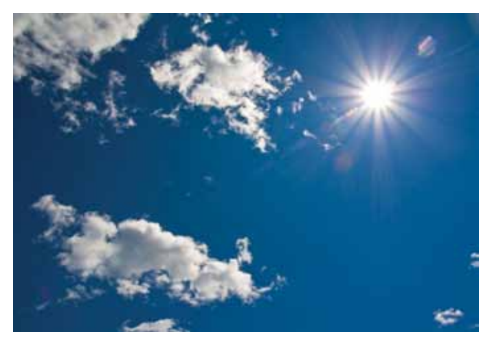
Sunlight helps kill pathogens through its destructive UV radiation.