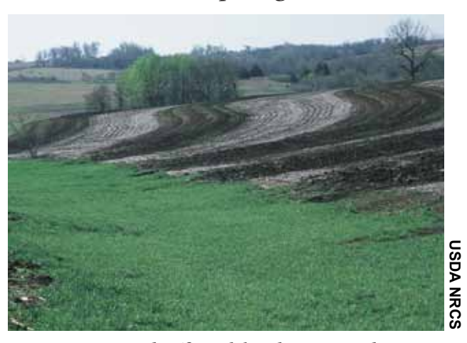
Vegetative buffers, like this grassed waterway, help filter out pathogens in runoff water before they reach a pond or stream.

Nutrient pollution in surface water can cause algae blooms or mats. Some kinds of pathogenic bacteria survive longer when attached to algae. UV penetration in water, important in reducing pathogens, is diminished with the presence of algae. Therefore, reducing nutrient runoff from fields and blending tailwater with ground water in ponds may aid in reducing both algae and pathogens in irrigation surface water.