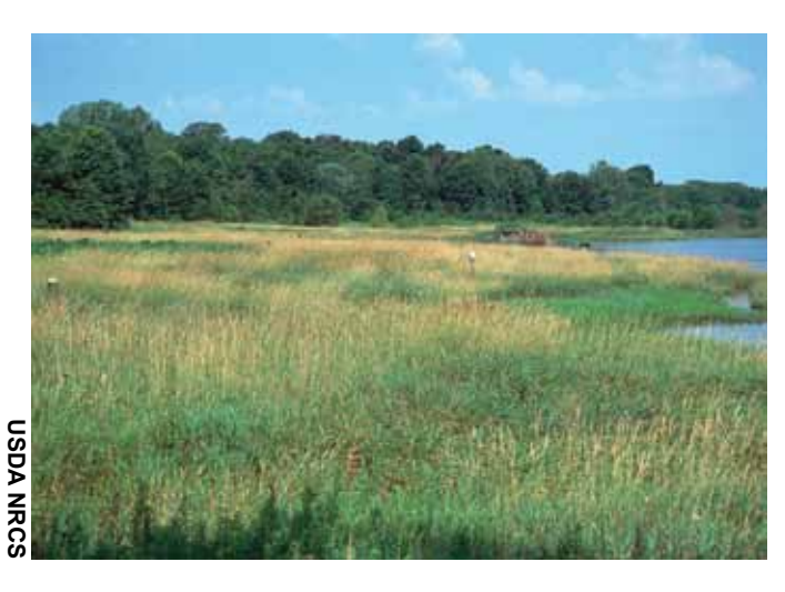
By using risk assessment strategies that help identify risk as well as explaining the rationale for management decisions that address that risk, farmers can effectively advocate for their conservation-based farming practices including cover crops and wetlands.