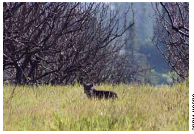
Predators like bobcats help keep rodent populations down in produce fields.

Assess the production field for crop damage or animal feces that can contaminate the crop. If found, cordon off a specified area—the damaged/contaminated area plus a small percentage—so the risk of cross contamination is removed from the growing area (see #9 in illustration). The size of the cordoned-off area depends on the amount of feces, splash that could occur from irrigation or rain, and how close the crop is growing to the soil. A five-foot radius for overhead-irrigated crops is typically felt to be sufficient; for drip-irrigated crops in a dry season the contaminated plant and its nearest two neighbors are often cited as sufficient buffering. Dispose of feces and