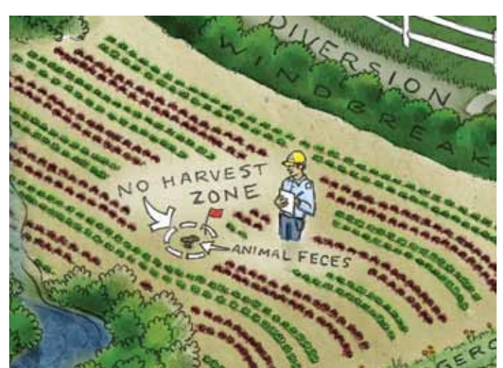
Periodically monitoring for animal damage or feces in the production field ensures a safe harvest.