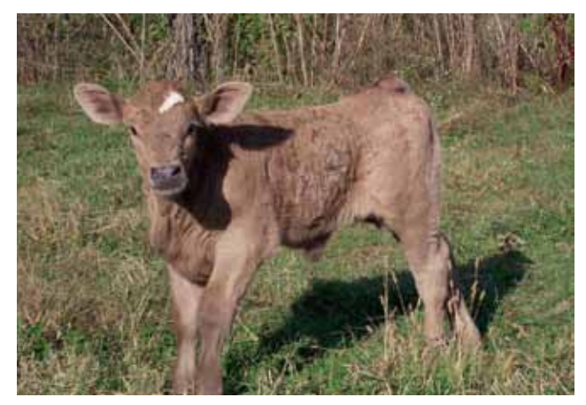
Young livestock are likely to carry higher levels of pathogens than adults.