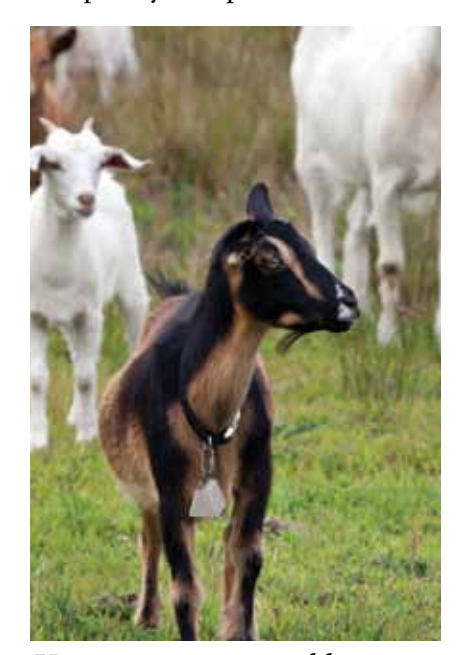
Using a waiting period between grazing livestock in orchards or produce fields and the harvest of the subsequent crop helps reduce the risk of pathogens in the livestock manure contaminating produce.

Composting is a treatment process that reduces the microbial hazards of raw manure. When done correctly, the composting process can kill most pathogens in manure. Some standards do not suggest a time period between application and other farming practices, while others recommend it be used only before planting, or only applied at least 45 days before harvest. In all cases, it is a good idea to record the dates that the compost is applied to the field. If not completely composted, it should be treated like raw manure.