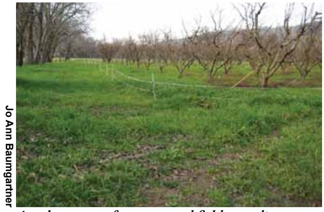
As a last resort, fences around fields can discourage wildlife from entering production areas.