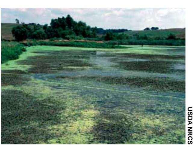
Algae blooms, like the one in this lake, may increase pathogens in the water.

Sediments have been shown to be a key site for pathogen persistence in water bodies. When sediments are stirred up in water, pathogens are brought back into the water column or flow. The reasons for increased pathogens in sediments are not well understood, but the lack of UV radiation and presence of biofilms may be responsible. UV is not able to penetrate sediments at the bottom of creeks, streams, ponds and lakes. Biofilms may provide protection from environmental stress and from predation by other microbes.