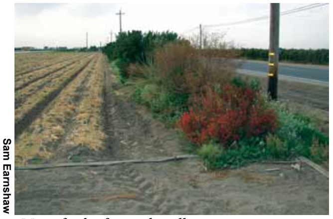
Many food safety audits allow non-crop vegetation on the farm. Some even encourage habitat restoration.

The OnFarmFoodSafety.org self audit, the USDA food safety audit, and several other audit programs allow for non-crop vegetation on the farm without losing certification or audit points. Global GAPs encourages habitat restoration. In writing the 'first draft' of the proposed FSMA rules, FDA's perspective about wildlife habitat is that they do not expect farmers to destroy habitat or otherwise clear farm borders around outdoor growing areas or drainages.