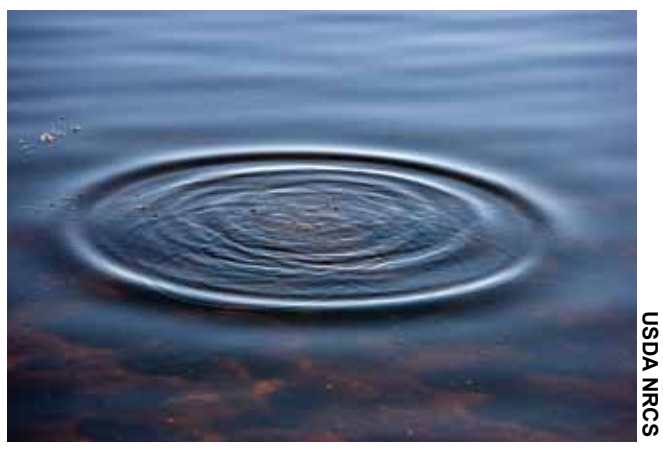
Clear water allows UV radiation from the sun to enter the water, which helps kill off pathogens.

When UV radiation is allowed to penetrate clear water, pathogens won't survive long. If there is sediment in the water or nutrients causing algal blooms, UV radiation isn't as effective. Proactively protect water quality by ensuring irrigation water infiltrates the soil well, and excess fertilizers and eroded soils are not causing pollution and murky water. UV penetration can then effectively foster pathogen reduction.