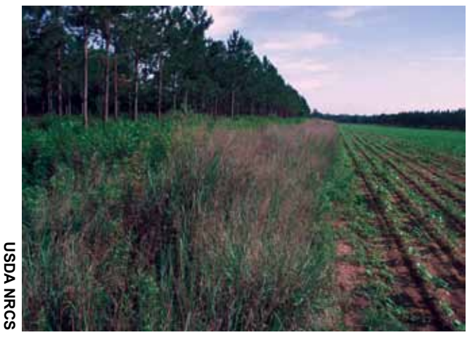
Produce contaminated by flood water is considered 'adultered' by the FDA. Converting sections of fields that flood often into permanent field borders reduces the movement of pathogens by intercepting overland water flow.