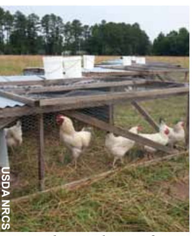
Washing boots after working with animals, properly composting manure, and keeping livestock out of produce fields can help reduce the risk of contaminating produce with pathogens.

harvesting of crops. Composting or heat-treating manure greatly reduces the number of pathogens in the manure, thus reducing the risk of crop contamination when it is applied as a soil amendment.