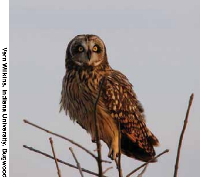
Seeing rodent-eating raptors, like this Short-Eared Owl, in habitat near a produce field is good for food safety.

carries. Young animals tend to carry higher levels of pathogens than adults. Seasonal stress may also result in higher pathogen levels. Cattle, for example, shed more E. coli in their manure during the summer than during the winter. Individual animals can be 'super-shedders' in a herd that has an overall low prevalence of shedding.