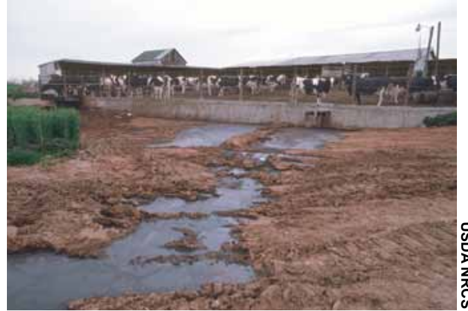
As water runs off areas where livestock congregate, it may pick up feces and pathogens along the way.

If contaminated surface or groundwater is used for irrigation, it may lead to persistent crop contamination. Pathogen-laden water during a storm or flood event can also contaminate crops.