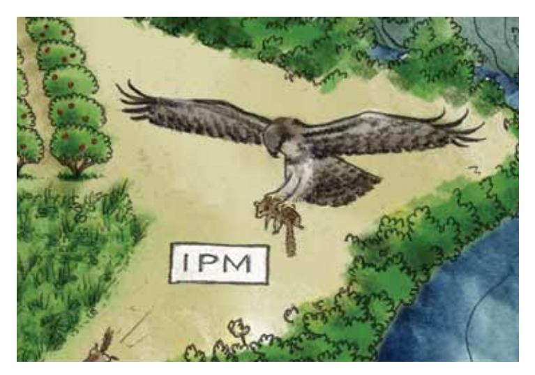
Beneficial natural processes, such as Integrated Pest Management (IPM), help to control rodents.

It is highly unlikely that farmers would ever intentionally sell contaminated produce. In the past, it was long held that common sense approaches were sufficient to ensure produce did not have food-borne pathogens. Animals were discouraged from production areas because they damaged crops. The potential for animal manures applied as fertilizers and soil amendments to result in water and crop contamination with human pathogens was well recognized. However, in 2006, everything changed when an outbreak of E. coli O157:H7 was traced back to a farm on California's Central coast, the center of the state's freshcut salad industry. While it was never unequivocally determined how the spinach became contaminated, non-native feral pigs, contaminated irrigation water, and adjacent cattle operations were all considered as possible sources. All wildlife and the habitat they occupied became scrutinized by public health, academia, and especially the leafy greens industry.