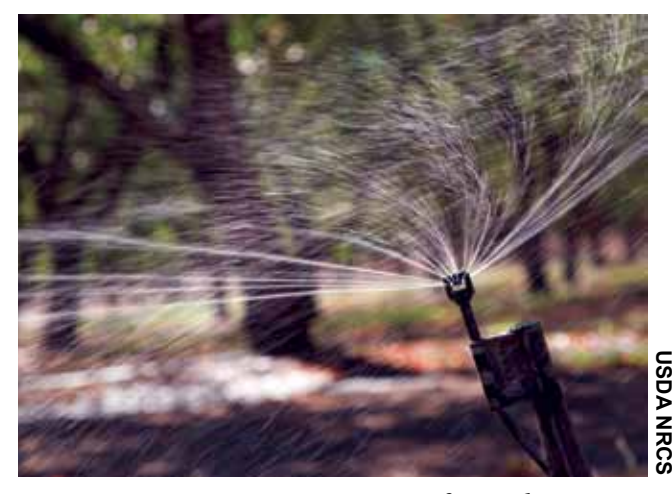
Testing your irrigation water for pathogens is a good food safety practice.

Prescribed grazing helps to disperse animal feces on the grazing lands where healthy stands of grass can help to filter pathogens (see # 25 in illustration). While cattle both in confined operations (fed grain) and out on pasture (eating forage) can test positive for E. coli pathogens, a USDA comprehensive review indicates that populations of these pathogens are higher in cattle fed grain diets. Additionally, confined operations concentrate feces and often increase animal vector occurrence, thereby increasing risk.